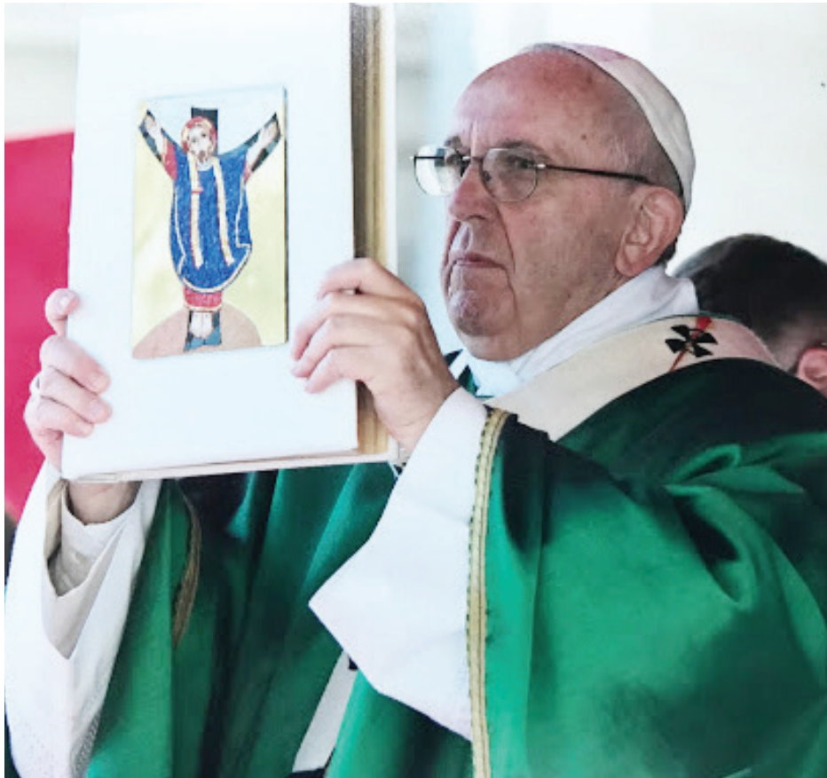
Pope Francis Blessing Congregation at St. Peter's, Vatican