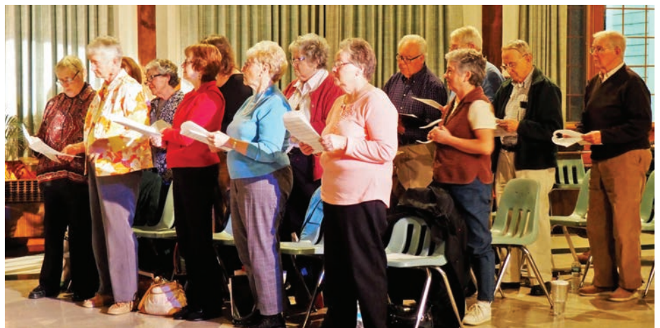
The members of the St. Pius X choir accompanied the singers on many of the songs.