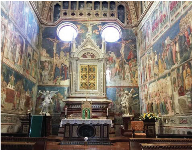
The Altar of the Corporal from the Duomo of the Assumption, Orvieto, Italy

programs to teach people new skills and encourage them to use their God given gifts in just and equitable ways. A week in the Holy Land was not only an opportunity for us to be pilgrims, praying and developing a deeper appreciation of the lands where Jesus lived, but also an opportunity to see the merciful works of CRS in action. We visited a Women's Solidarity Group consisting of