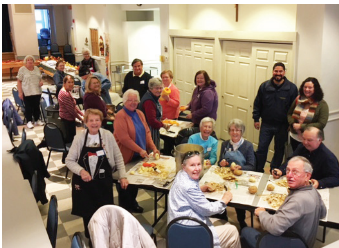
Thanksgiving Day prep for the homebound.