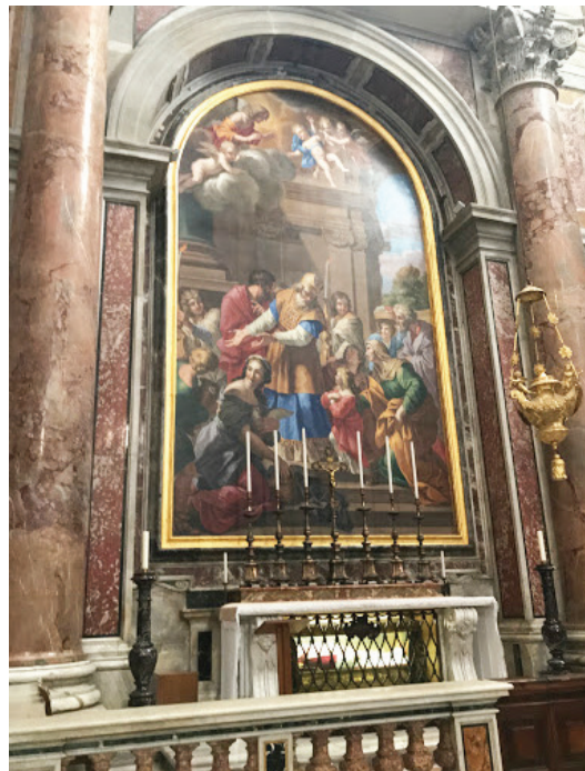
St. Pius X Altar, St. Peter’s Basilica, Vatican

The program, entitled “The Church’s Works of Mercy,” consisted of study (no tests to take or papers to write) and an opportunity to witness mercy in action. We listened to a number of presentations from Catholic Relief Services (CRS). As a parish, we experience, or hear of CRS whenever there is a natural disaster in the world. The church mercifully responds to that disaster, for example hurri-