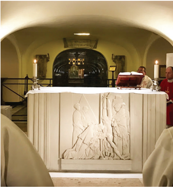
Mass at the tomb of St. Peter, Vatican