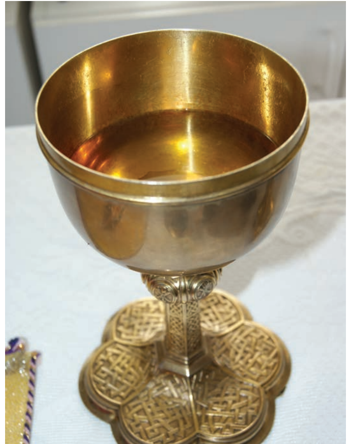
Oil filled Ciborium