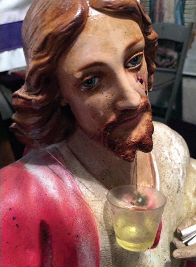
Sacred Heart of Jesus