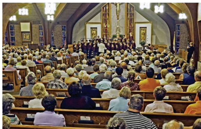
The concert was well attended by our parishioners.