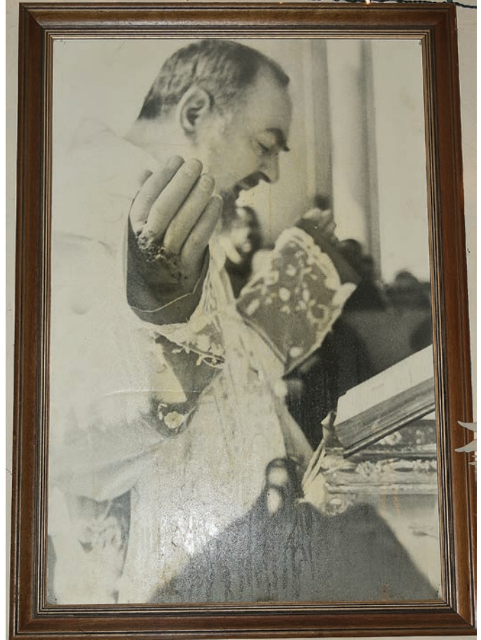
St. Padre Pio

The process to sainthood is slow. All documentation of alleged miracles need to be checked. Reports from nurses and caregivers need to be organized in readable fashion and dated in an orderly fashion.