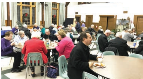
Friends celebrating ▲