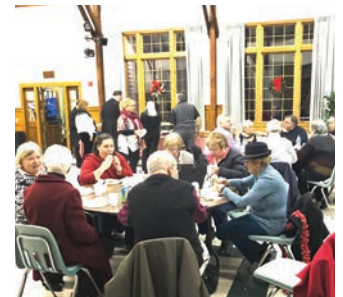
Friends celebrating ▲