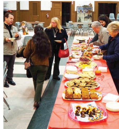
◀ Many stayed to enjoy the cookies and other treats at the after-Mass party hosted by the Parish Youth Ministry.