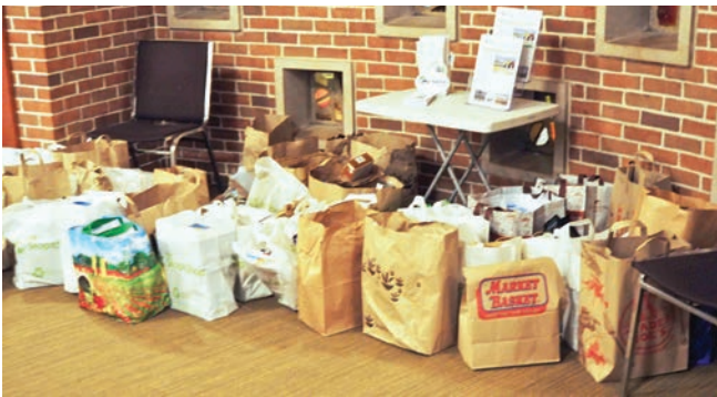
▲ Many people brought bags of groceries which were donated to the Yarmouth Food Pantry.