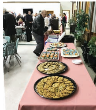
▲ Food and treats for all