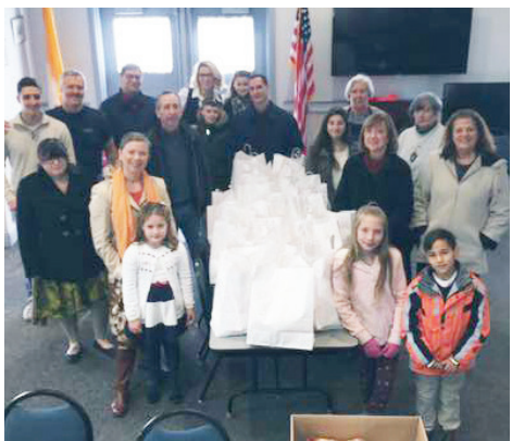
Thanksgiving Peelers & Drivers