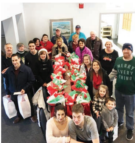
Christmas Organizers & Drivers

What does it take to prepare and deliver Thanksgiving & Christmas dinners for needy parishioners? How many people are involved? Actually it takes quite a few volunteers, 20 to 25 to serve about 30 meals each holiday.