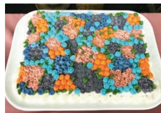
Wonderful Cake ▲