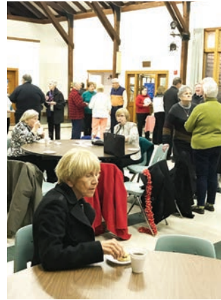
Enjoying the evening ▲