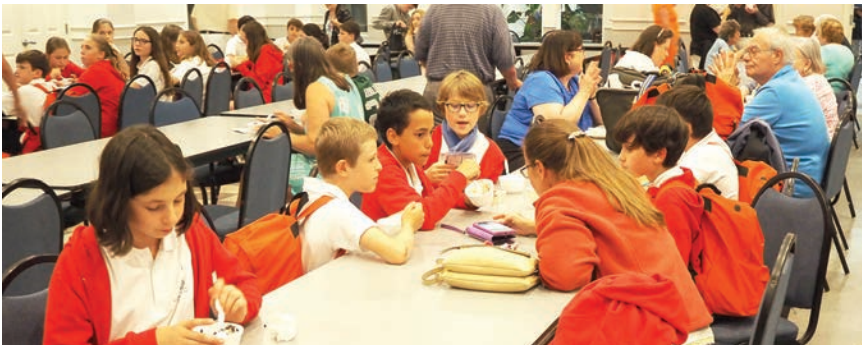
Following the performance, the audience and members of the choir were invited to the Parish Life Center for an Ice Cream Social.