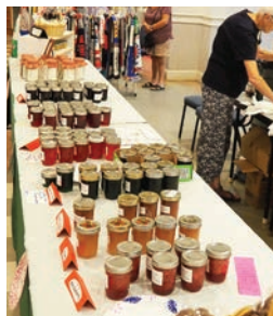
Jams & Jelly Jars