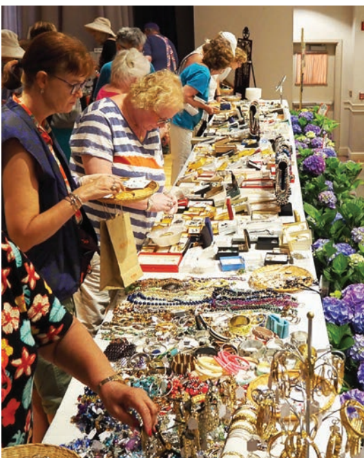
Jewelry Table Galore