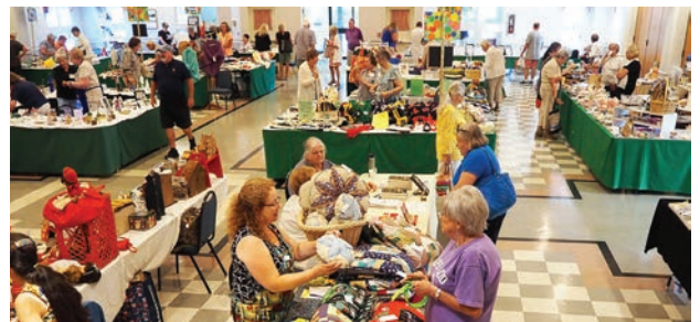
Room buzzing with busy shoppers